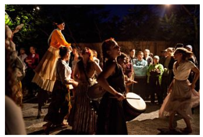
Double Edge Theatre's "Once a Blue Moon" offered audiences an active experience.

Those little animals that peer out of the greenery in the distance—that's such a small detail, so far away. Was there an actor hiding there...a puppet?